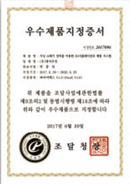
Certificate of designation for innovative products (Commissioner of the Korean Intellectual Property Office)