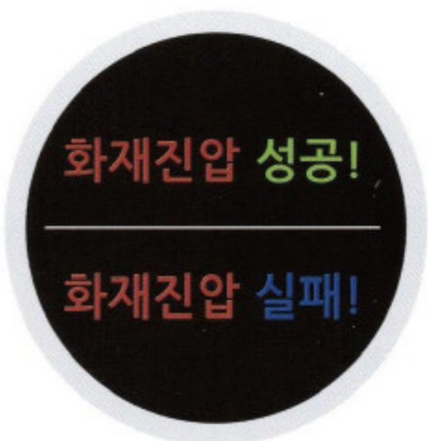
Success vs Failure