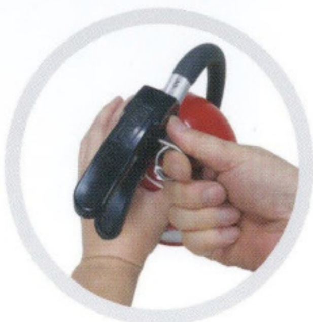
Remove safety pin