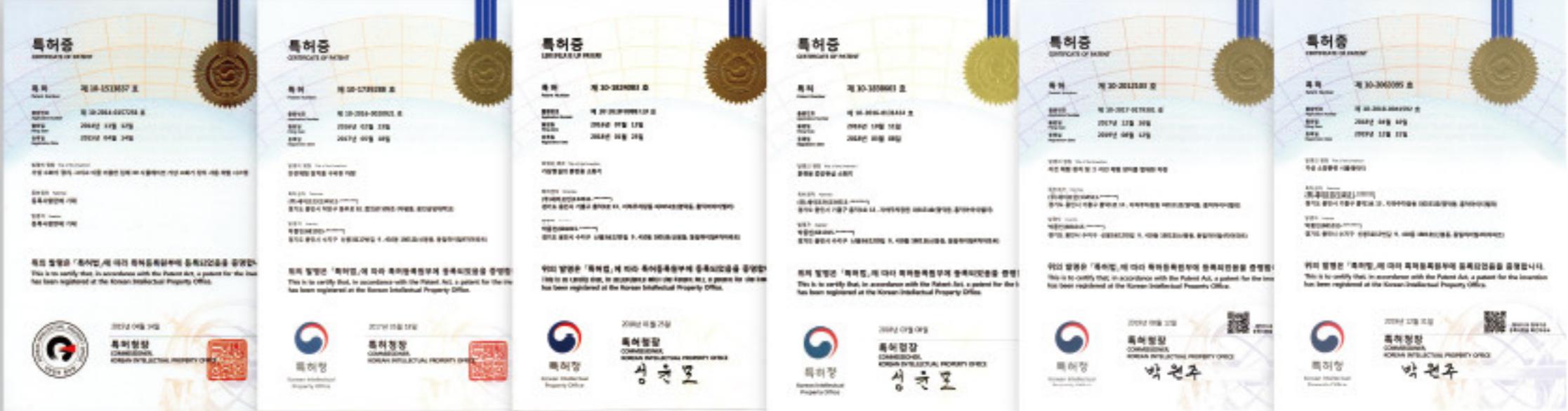
Patent No. 10-1513837, Patent No. 10-1739288, Patent No. 10-1824083, Patent No. 10-1838603, Patent No. 10-2012103, Patent No. 10-2063395.